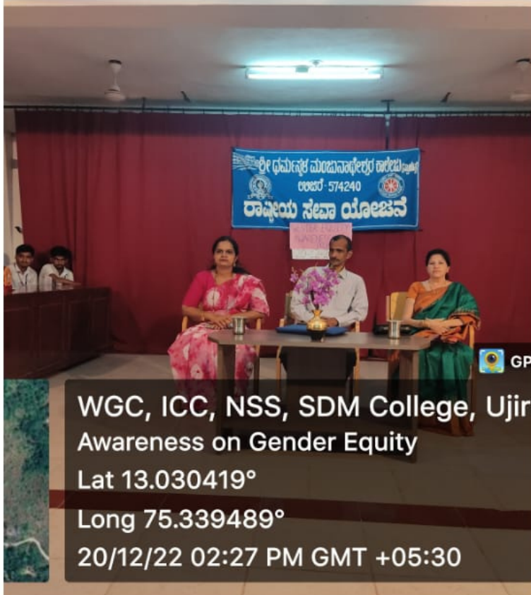
WGC, ICC, NSS, SDM College, Ujire Awareness on Gender Equity Lat 13.030419° Long 75.339489° 20/12/22 02:27 PM GMT +05:30