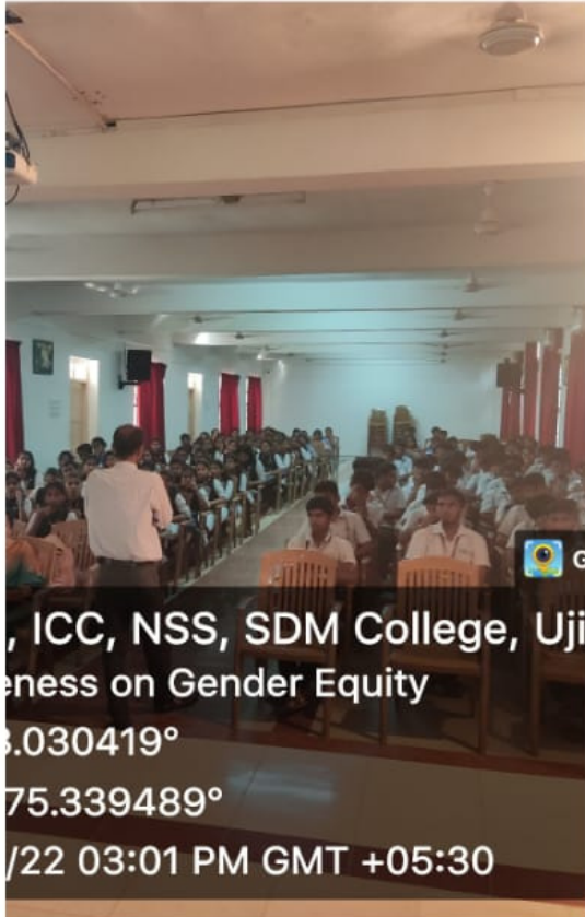
WGC, ICC, NSS, SDM College, Ujire Awareness on Gender Equity Lat 13.030419° Long 75.339489° 20/12/22 03:01 PM GMT +05:30