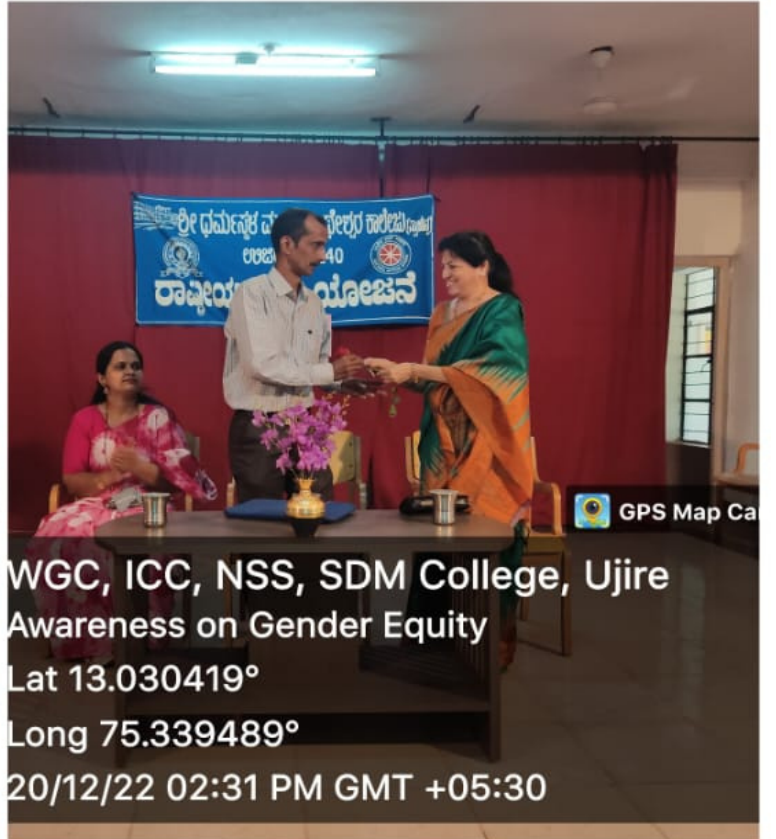
WGC, ICC, NSS, SDM College, Ujire Awareness on Gender Equity Lat 13.030419° Long 75.339489° 20/12/22 02:31 PM GMT +05:30