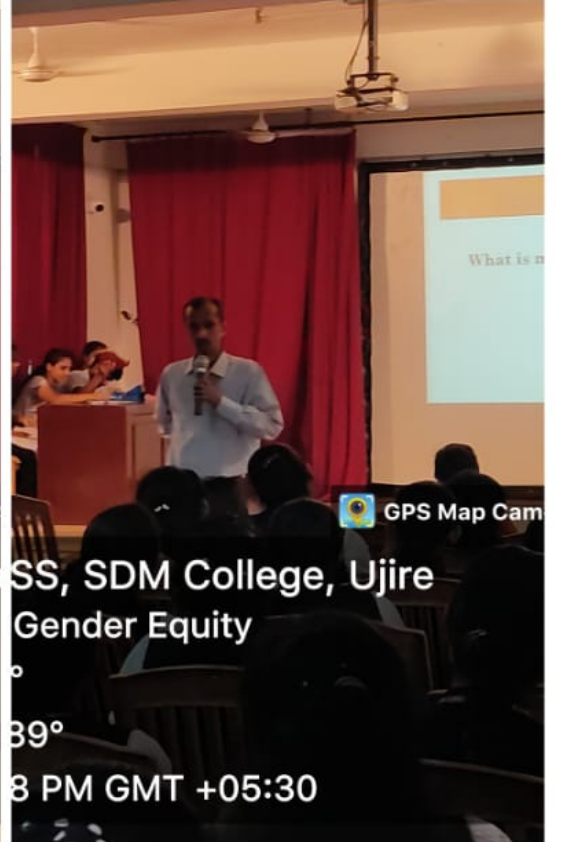
WGC, ICC, NSS, SDM College, Ujire Awareness on Gender Equity Lat 13.030419° Long 75.339489° 20/12/22 02:28 PM GMT +05:30